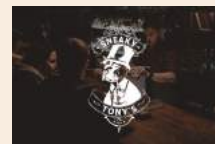
Sneaky Tony's Somewhere in China Town