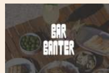
Bar Banter 483 Hay Street Subiaco