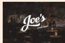
Joe's Juice Joint 232 William St Northbridge