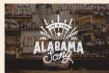
Alabama Song 232 William St Northbridge