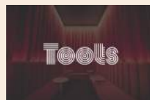
Toots Somewhere in China Town