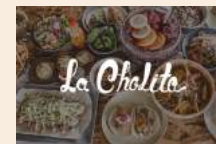
La Chollita 279 William St Northbridge