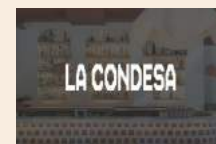
La Condesa 483 Hay Street Subiaco