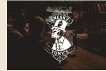
Sneaky Tony's Somewhere in China Town