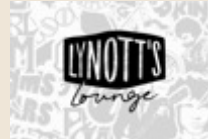
Lynott's Lounge 100 Melbourne St Northbridge