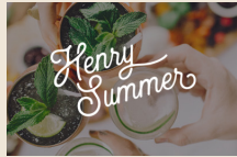
Henry Summer 69 Aberdeen St Northbridge