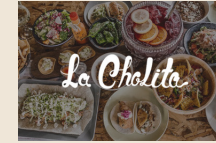
La Chollita 279 William St Northbridge