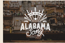
Alabama Song 232 William St Northbridge