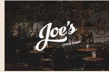
Joe's Juice Joint 232 William St Northbridge