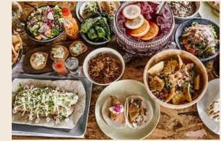
La Cholita 279 William st Northbridge