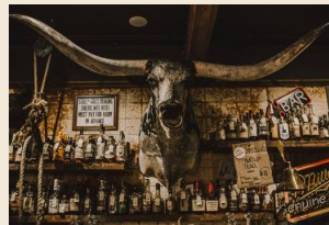
Alabama Song 232 William St Northbridge