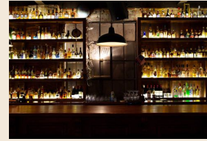
Sneaky Tony's 38 Roe St Northbridge